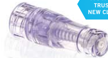
LIFESHIELD MICROCLAVE CLEAR

NOW AVAILABLE TRUSTED DESIGN. NEW CLEAR HOUSING.